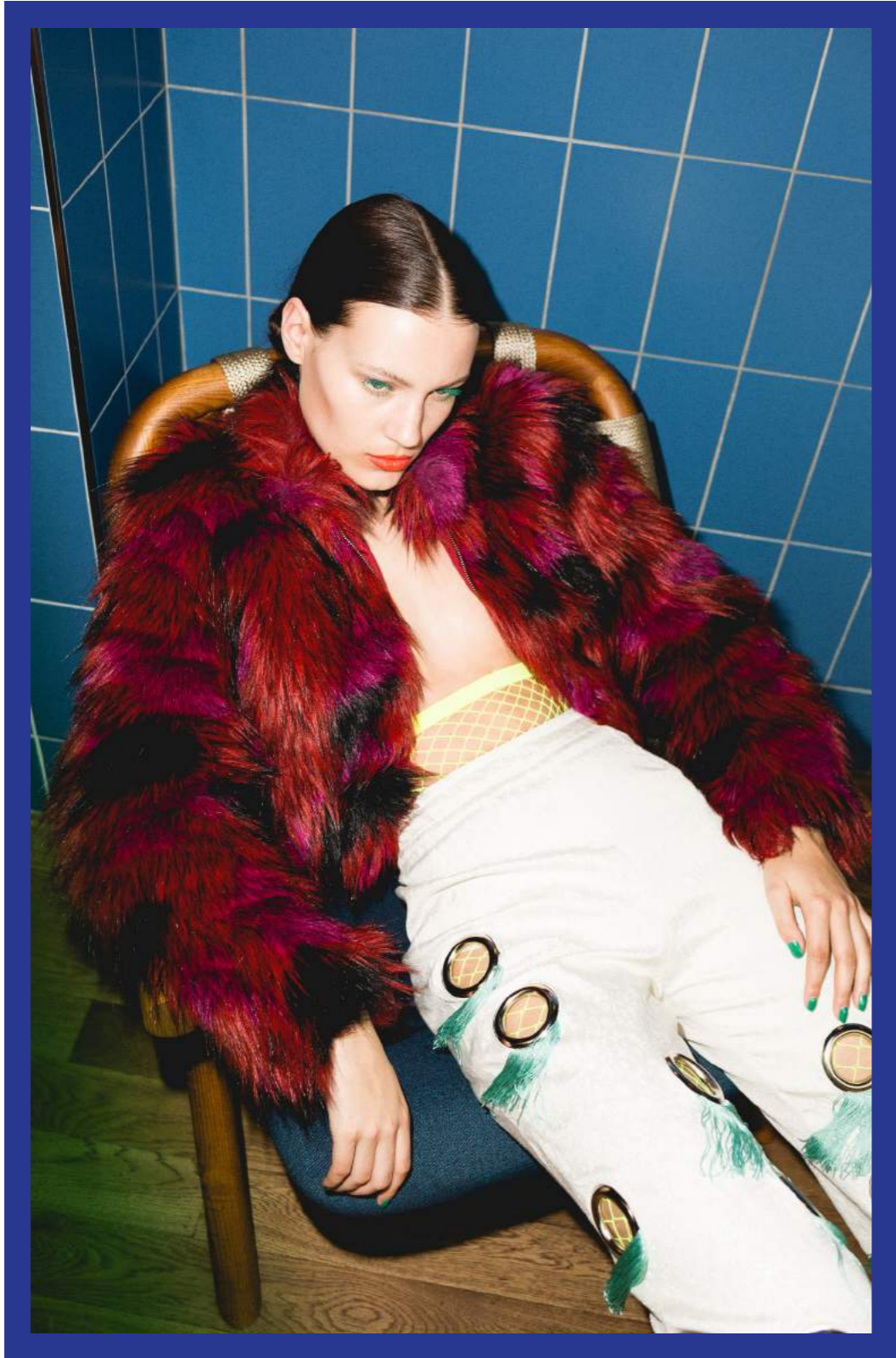
Jacket | Esther Haamke Trousers | Anbasja Blanken Tights | Camden Market