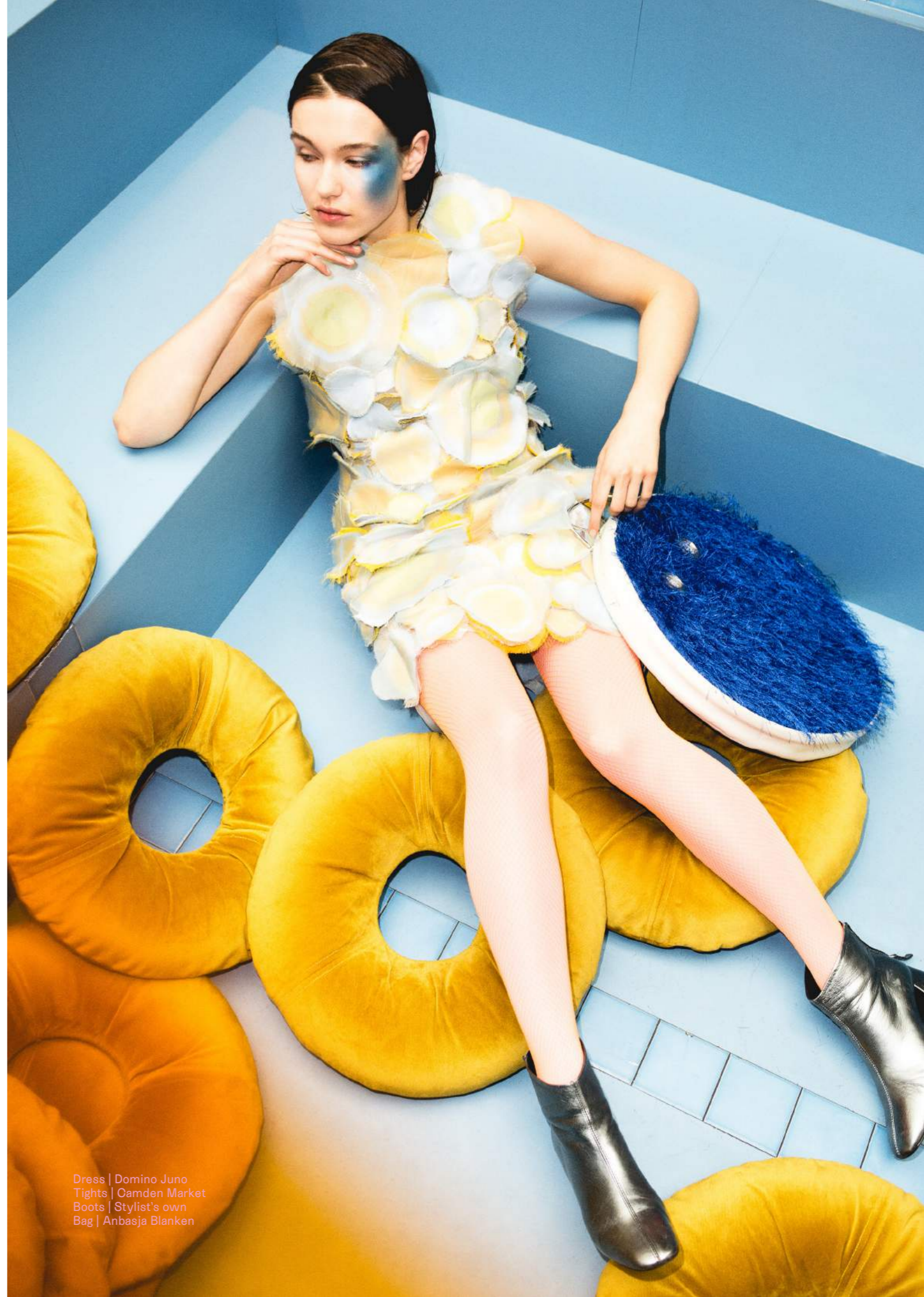
Dress | Domino Juno Tights | Camden Market Boots | Stylist's own Bag | Anbasja Blanken