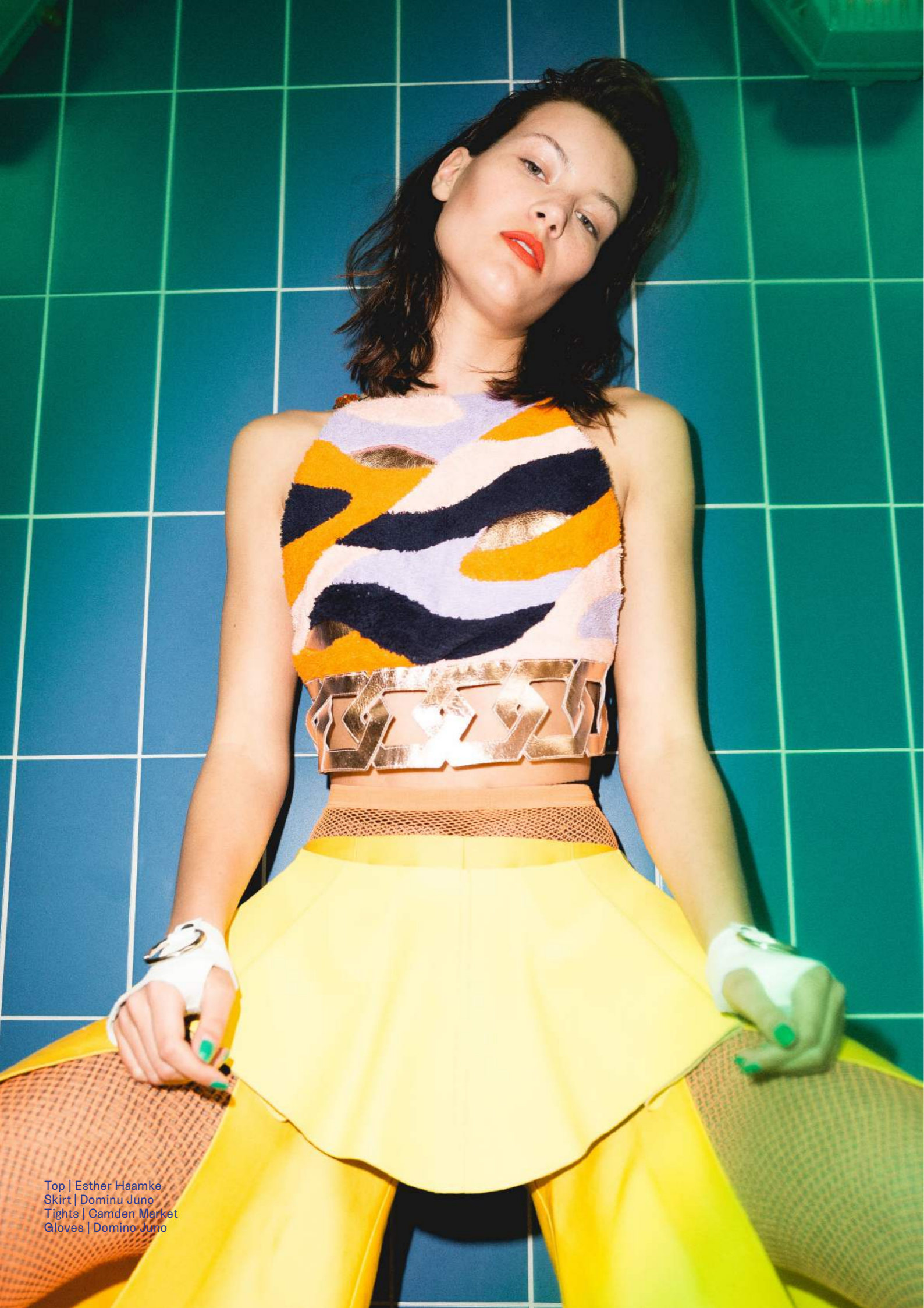
Top | Esther Haamke Skirt | Dominu Juno Tights | Camden Market Gloves | Domino Juno